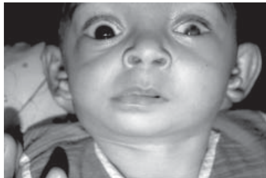
Fig. 1: Goldenhar syndrome showing marked facial asymmetry, malformed ears, pre-auricular tags, left corneal opacity with epibulbar dermoid.

A 6-month female of non-consanguineous marriage presented with history of left corneal opacity since birth and absence of right external auditory meatus. The antenatal period was uneventful and the family history insignificant. On clinical examination the following was seen (Fig. 1) a. facial features : flat nasal bridge, right sided – deviation of angle of mouth, hypoplasia of facial muscles especially depressor anguli oris, hypoplasia of the right mandible. b. ears : right microtia, bilateral preauricular skin tags. c. eyes : left microphthalmos with epibulbar dermoid and corneal opacity. d. spine : hemivertebra of third thoracic vertebra. Systemic examination did not