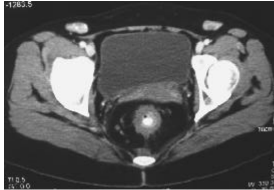
Fig. 3 : CT scan showing circumferential (annular) thickening of rectum.

forms as; i) fistula in ano, which is the commonest manifestation; ii) ulcer with undermined edge which is the next frequent form; iii) stricture which is short annular and firm with nodular surface which needs to be differentiated from malignancy, iv) multiple small mucosal ulcer as a part of miliary disease, v) lupoid form presenting as a sub mucosal nodule with mucosal ulceration, vi) verrucous form with smooth warty excrescences. 3 Bockus et al have reported 70% of cases of primary infection with tuberculosis